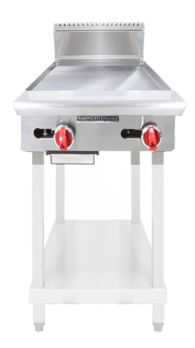
Model shown with optional equipment stand