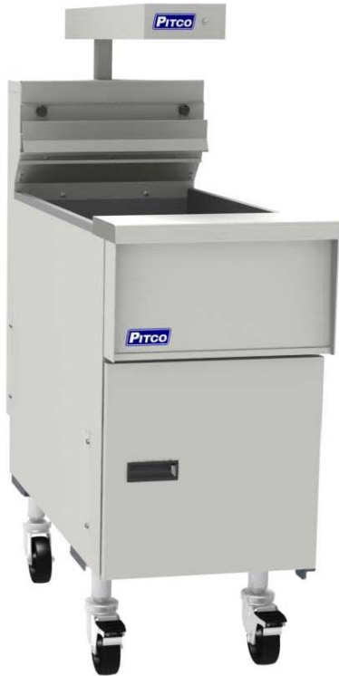
SGBNB18 with optional food warmer and casters

To be used with the Solstice Fryer line. Unit can be installed on either side or between fryer(s). Design to match existing or accompanying fryers. Pan area allows for holding and draining of finished product. Drain screen easily lifts out for cleaning. Bottom Shelf provides ample storage for breading, batter, food utensils, etc. *Bottom Shelf is not provided when a filter pump or flush hose is located inside the dump station.