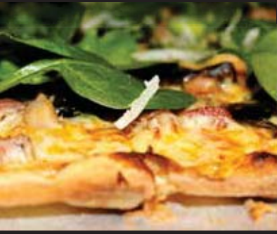
for True Artisan Pizza