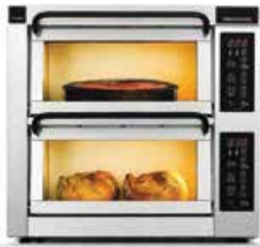
Model shown: PM 452ED