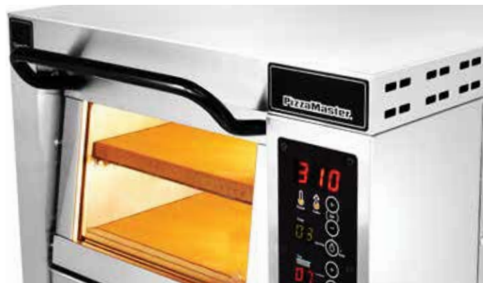
Sleek, brushed stainless-steel surfaces, virtually seamless joints and no visible screws or rivets make the oven very smart and easy to clean.