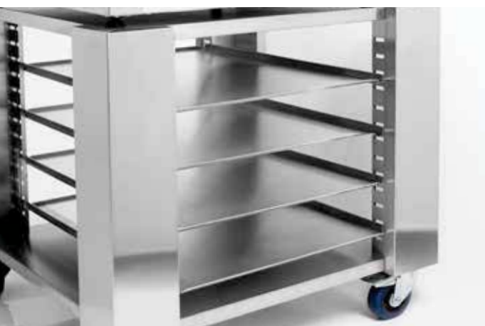
Support PM 451-S equipped with Shelf support package SP-1