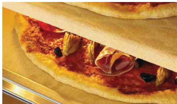
Each oven chamber can be divided easily into two decks by fitting an intermediate hearthstone and element, which doubles the oven capacity.