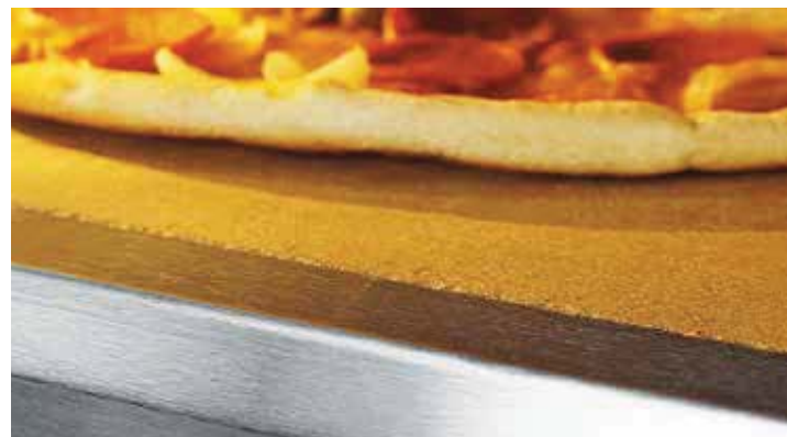
Hearth of natural material, with crisping function for perfect texture and flavour