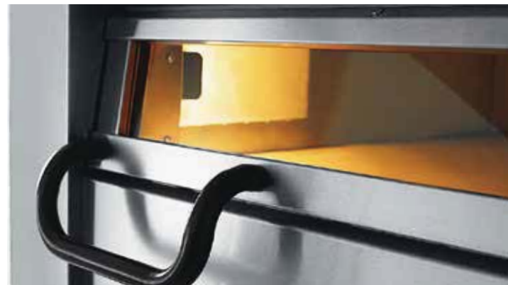
Robust, smoothly-opening door with large window and ergonomic handles