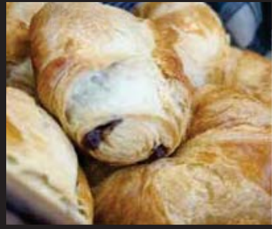
for Tastier Bread and Pastries