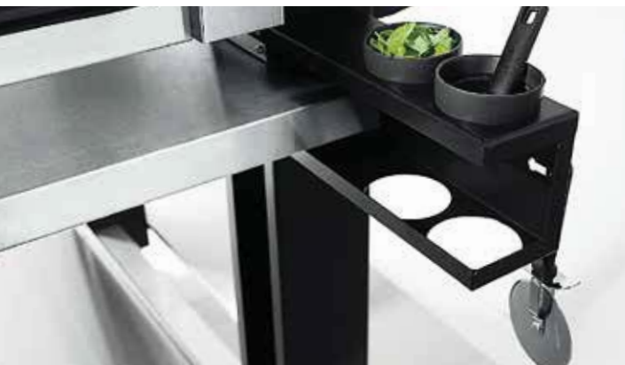
Oil - and spice rack for final touch