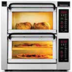
Model shown: PM 402ED-1