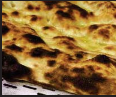
for High Temperature Baking