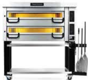
Model shown: PM 732ED, including extra equipment