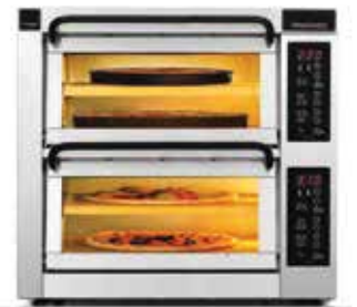
Model shown: PM 552ED-2