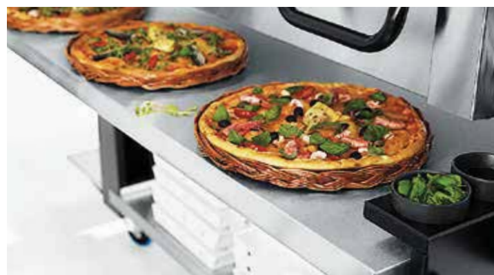
Retractable frontal unloading shelf lets you make or save space quickly and easily