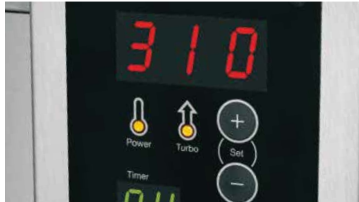
The stepless electronic controls, turbo-start function and digital display are logical and easy to use.

This beauty also has functions. It conceals a unique and effective spatial insulation concept, improves the environment, interfaces perfectly with the user and makes it very easy to clean the oven. It reflects the quality that runs right to the heart of every PizzaMaster® oven, where performance is what matters. In this respect, the oven is engineered to do exactly what we promise, enabling you to deliver professional results in every situation where convenience is essential and quality is paramount.