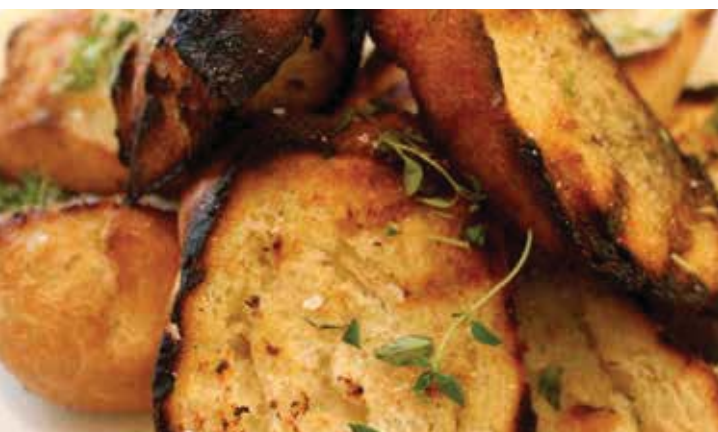
for Genuine MultiCooking

This can be crispy and shiny baguettes as well as any other type of bread like, traditional German or Mediterranean Bread, Italian delicacies like Ciabatta and Focaccia, Pastries like Croissant and Danish or local specialties like baklava. This is just a few examples of bread and pastries that can be baked in our ovens.