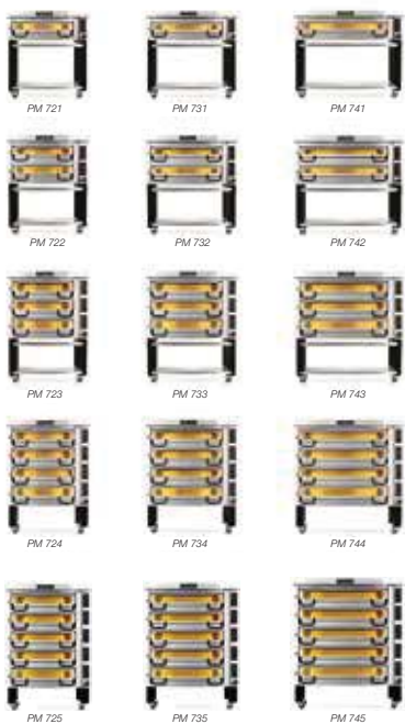
PM 700 Series