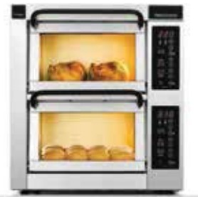
Model shown: PM 352ED