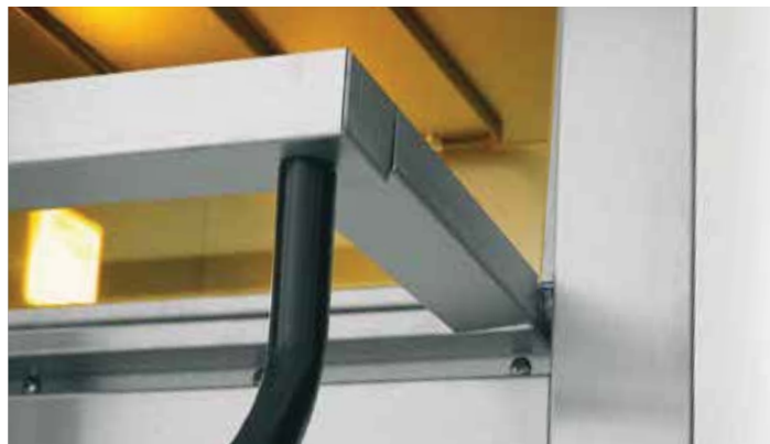
A big strong door with ergonomic handle and large window enables easy loading, inspection and unloading. Halogen lights complete the picture.