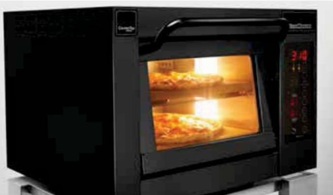
PM 351ED-1 made in Phantom Black