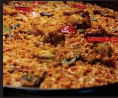
for Genuine MultiCooking