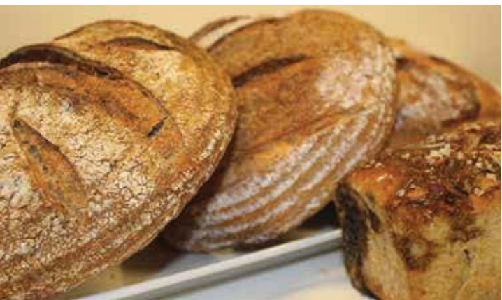
for Tastier Bread and Pastries