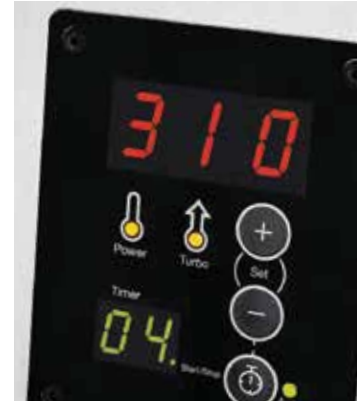
Digital or classic control panel - both logical and easy to use