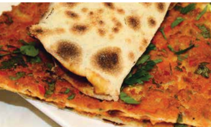
for High Temperature Baking

Our passion strive us to always deepen and keep our knowledge up to date for – the production and the characteristics of the flour, how to process the dough, the origins and quality of the toppings, of course taking in consideration the habits, tastes and availability of different countries – We deliver all this passion and knowledge into our ovens to make them the very best tool available for making all types of pizza better for everyone to enjoy.