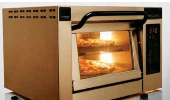
PM 351ED-1 made in Royal Gold