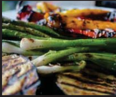
for Genuine MultiCooking