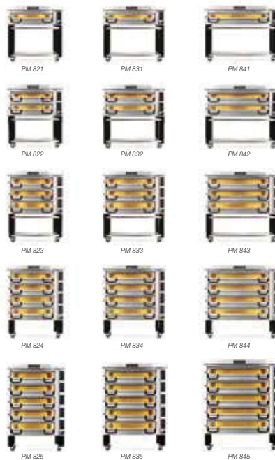
PM 800 Series