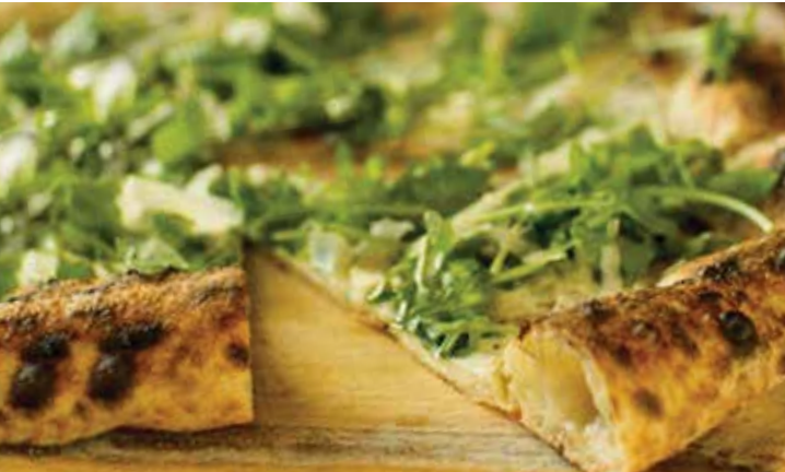
for True Artisan Pizza