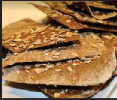
for High Temperature Baking