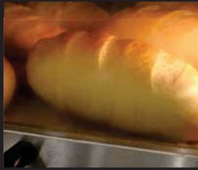
for Tastier Bread and Pastries