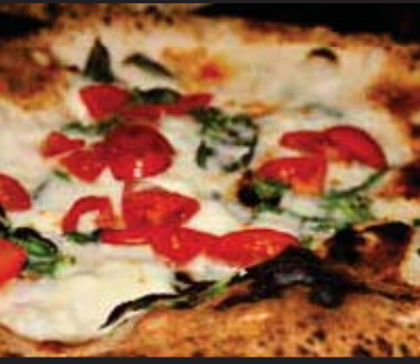
for True Artisan Pizza