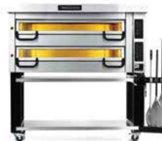
Model shown: PM 932ED, including extra equipment