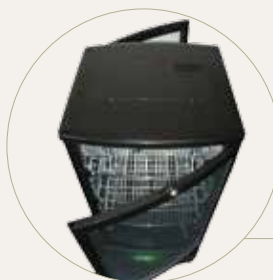
Double lockable curved doors