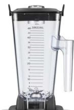
1.4 L Standard Container with Lid and Blade Assembly